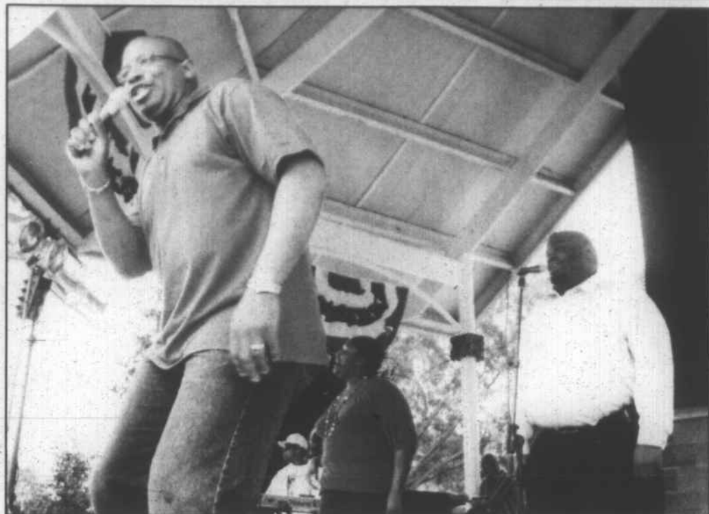
Members of Nu Favor perform.

If you or a family member is struggling with substance abuse HELP is a phone call away. The Twin City Area Narcotics Anonymous Helpline can be reached at 800-365-1035 or online at www.tcana.org . For meeting schedules and additional information for this 12-step Recovery Program, please call the number or visit the Web site.