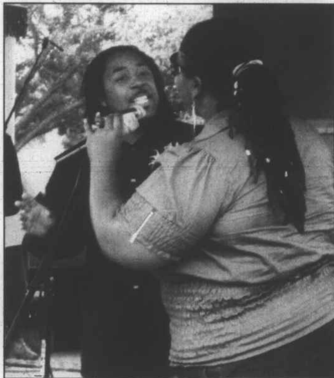
Two members of Peace of Mind.