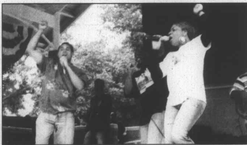
Left: The Gatekeeperz rock the house.

Gospe Fest is made possible by the support of these sponsors: AT&T, Food Lion Stores, Mechanics & Farmers Bank and Reynolds American.