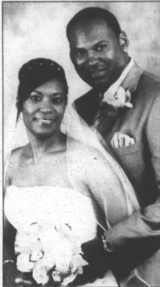
The bride and groom.