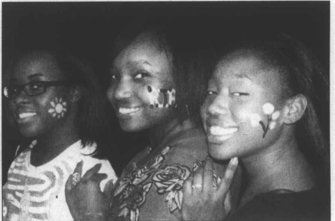
Three young attendees pose after having their faces painted.