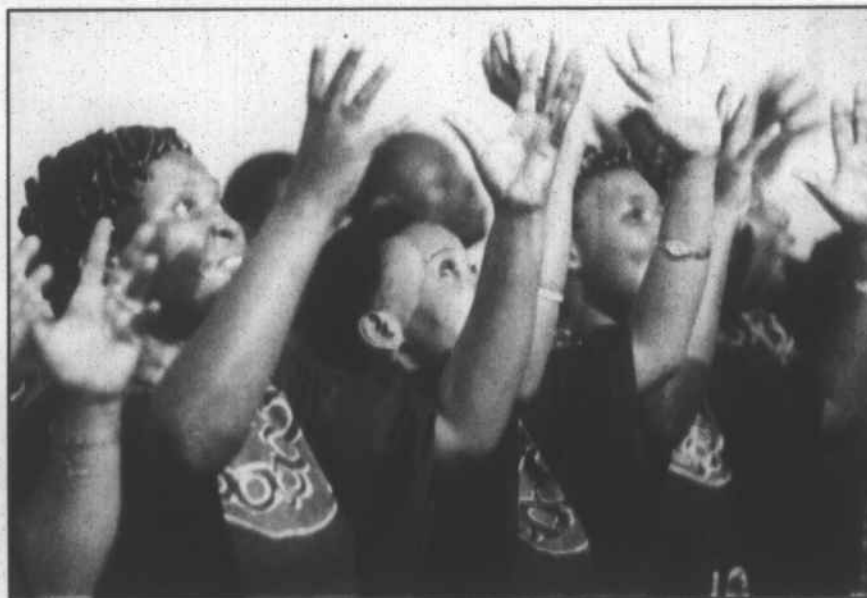
Members of the Bukoba Choir perform.

The Goler Memorial International Ministry, which staged the event, strives to support the needs of people coming to this community from other countries as well as assist countries with some of their most pressing needs. The ministry is currently supporting a school in Cape Town, South Africa, by providing food and shoes