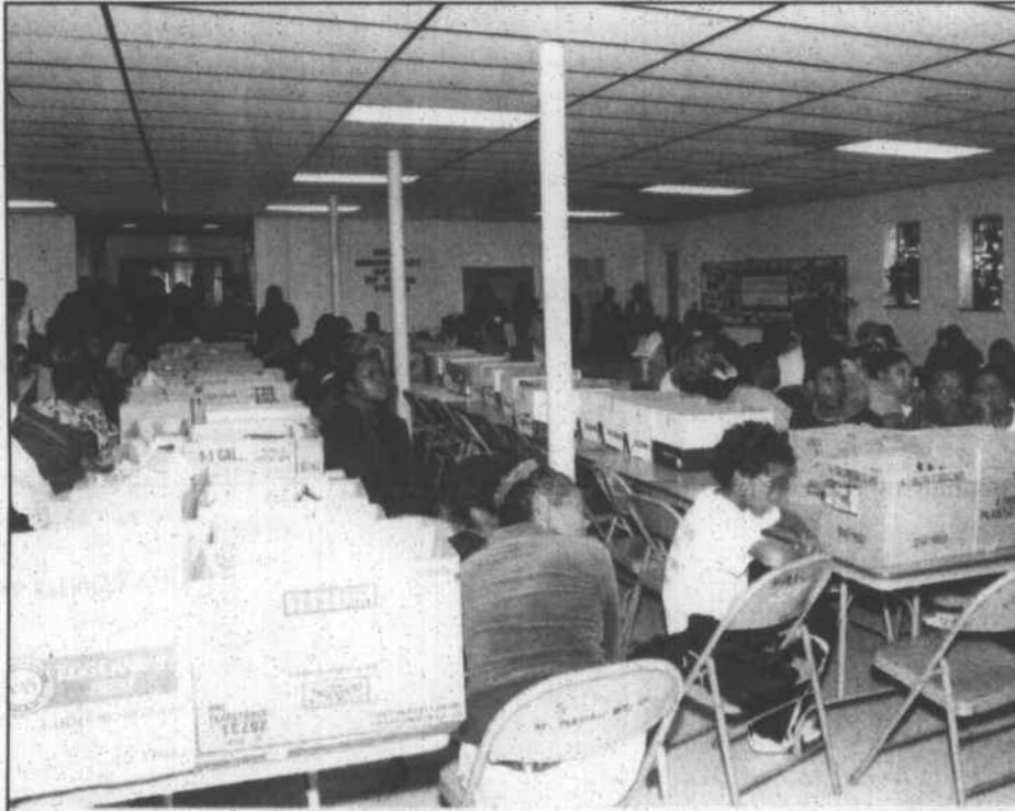
Church members prepare to deliver food.