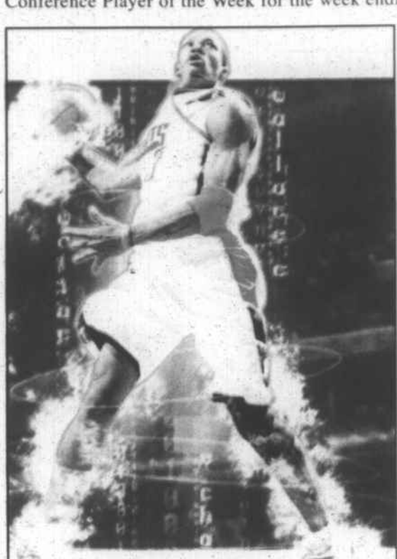
Forward Gerald Wallace in action.

Charlotte Bobcats forward Gerald Wallace was selected by the NBA as Eastern Conference Player of the Week for the week ending Nov. 29.