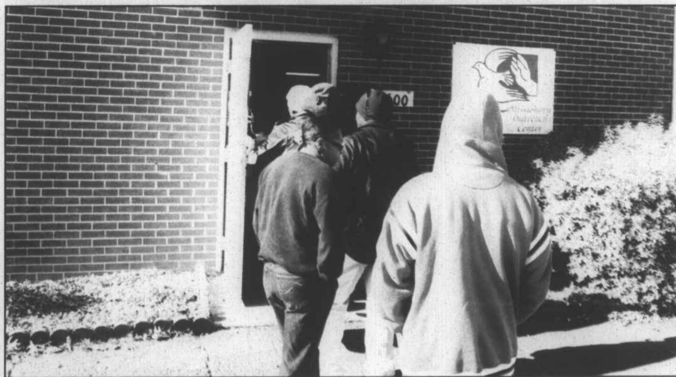
A line forms at the church at about noon last Thursday.