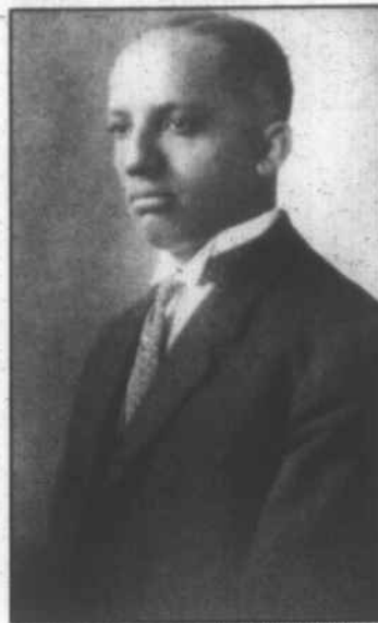
Dr. Carter G. Woodson

The event will culminate with a cake-cutting ceremony and a brief discussion of the life and work of Dr. Woodson, who died in 1950. The son of former slaves, Woodson was already thoroughly self-educated when he enrolled in high school at the age of 20, receiving his diploma in just two years. He went on to earn a B.A. from the University of Chicago and a Ph.D. in history from Harvard, where he was just the second African-American to earn such a degree.