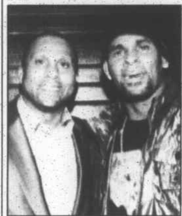
Tavis Smiley with R. Kelly.

According to SmileyBooks, in his memoir, which Kelly will pen with David Ritz, the singer will detail the agony of losing his mother; discuss his creative genius; and talk about the child pornography charges that still haunt him today even though he was found not guilty of the charges in 2008.