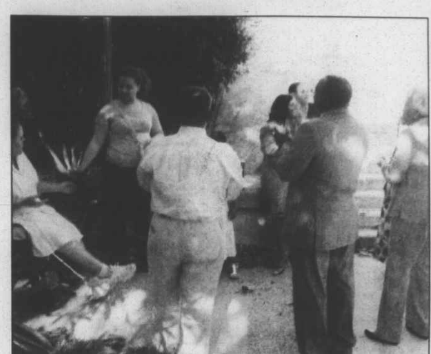
A small crowd prays near City Hall.

"We are launching this endeavor because of the rise of antagonism for prayers in public places; because of our overwhelming need for God's intervention in the affairs of humankind; and because of the need