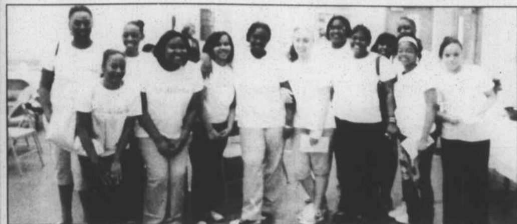
Some of the young women who take part in E-Girls.

For more information, visit his Web site, www.soulfullproductions.com .