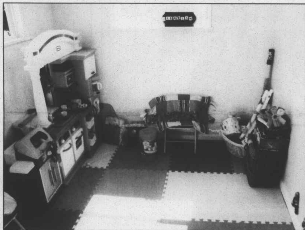
The interior of the new playhouse.