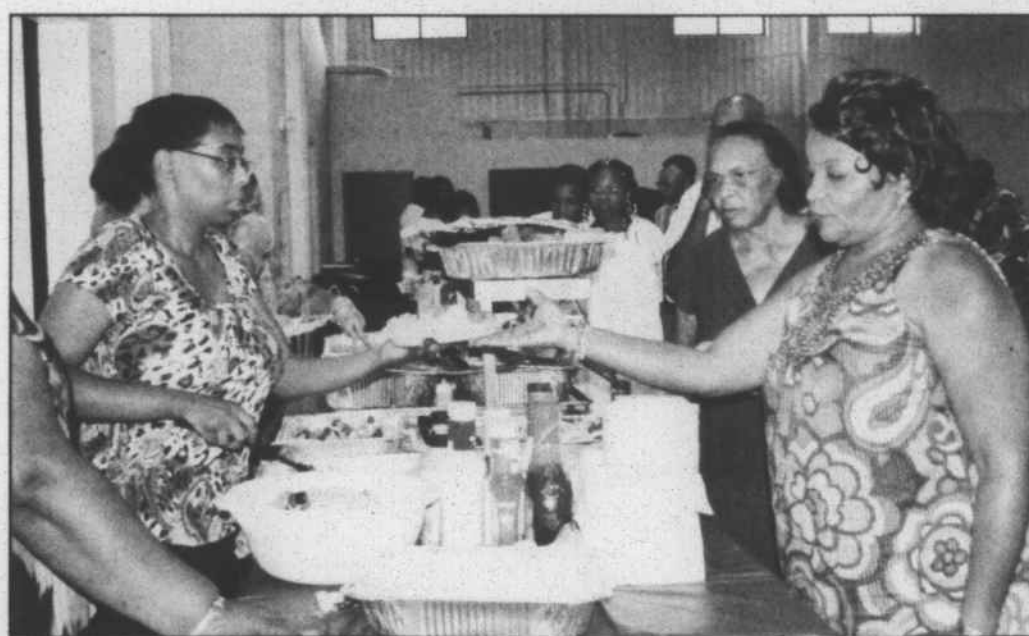
Attendees are served home-cooked food.