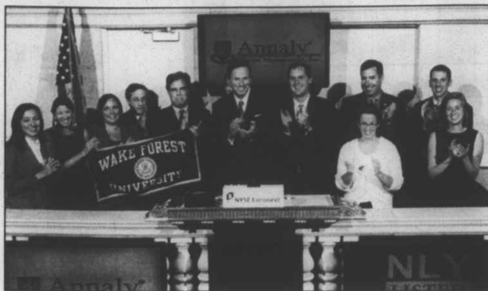
Alumni and supporters of WFU ring the opening bell.