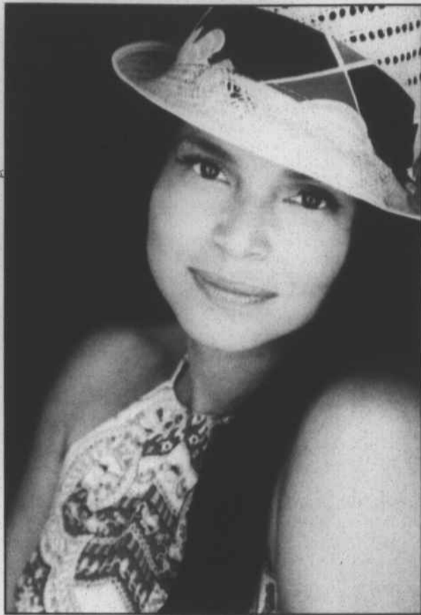
Victoria Rowell is an actress and author.