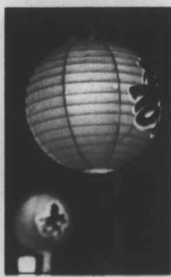
Japanese lanterns are a universal symbol of peace.