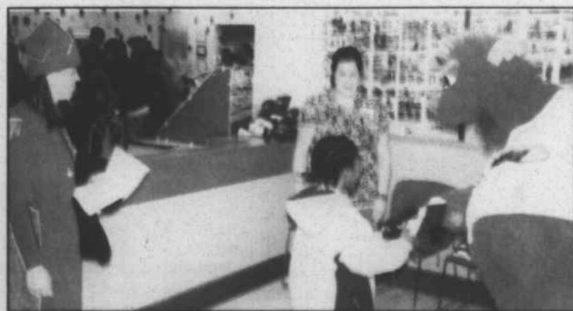
Volt gives a child a Dash hat and t-shirt.