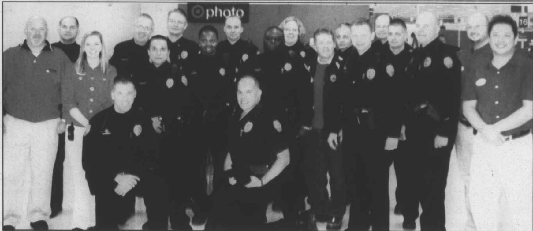
Winston-Salem police officers pose with Target employees.

In February 2011, Chosen Generation Center in Greensboro will begin its celebration of the anniversary of Boy Scouts of America and the "Faces of Scouting," with a kickoff reception on Feb. 6, 2011. Area churches with scouting troops will be on hand for the event, which will take place at the International Civil Rights Center and Museum, where the "Faces of Scouting" exhibit will be on display. Organizers are searching for African Americans who have earned the following: Eagle Scout Rank; Scoutmaster Merit Award; Distinguished Commissioner Award; Silver Beaver Award; Silver Antelope Award; Silver Buffalo Award; and/or the Wood Badge. For more information, email mailman.27260@yahoo.com.