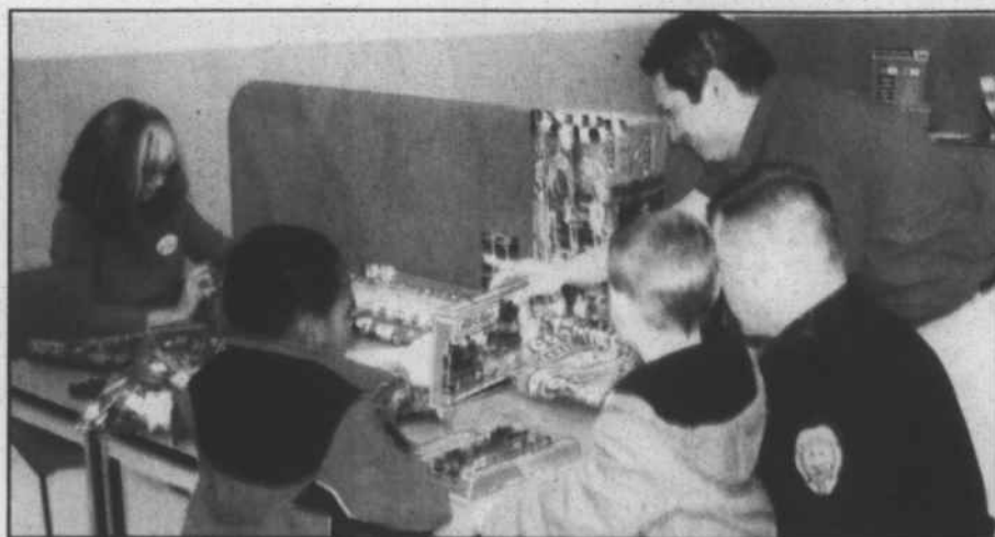
Above: Target employees wrap gifts.