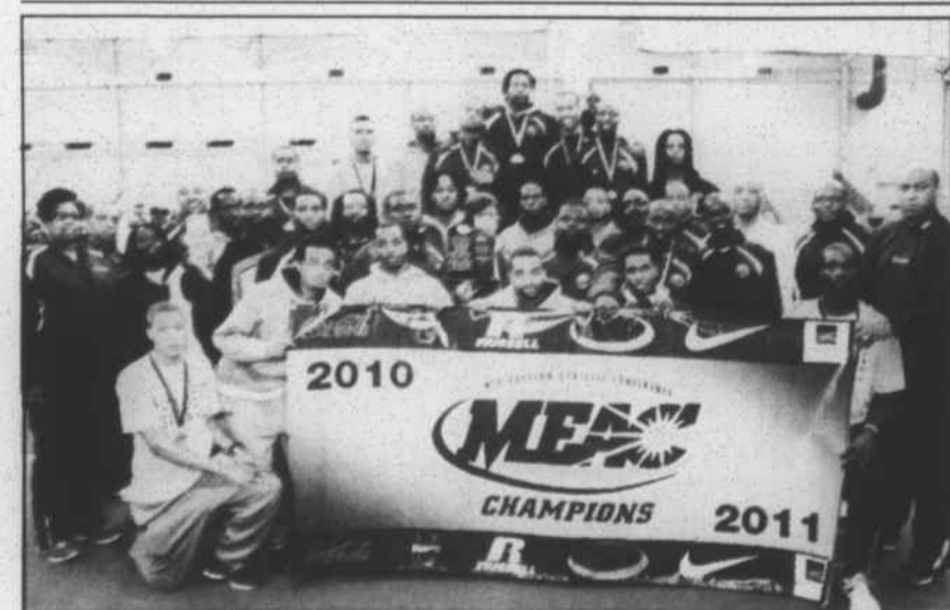
The Men's and Women's champs.