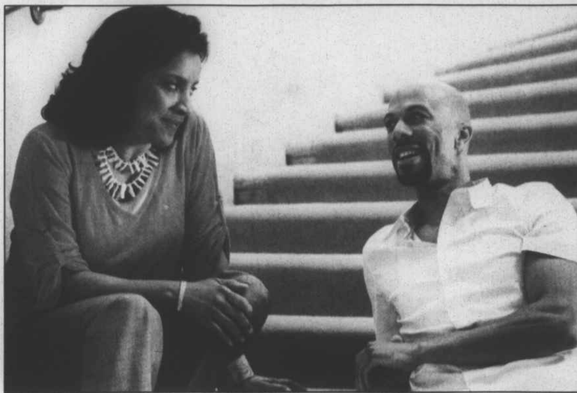
Phylicia Rashad and Common in a scene from the film "Just Wright."

Johnny Mathis performs with the Symphony last year.