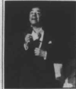
NC Symphony Photo

Approximately 200,000 people attended the North Carolina Symphony's public concerts across the state during this concert season. The orchestra also performed 43 free concerts to elementary and middle school students representing over 25 North Carolina counties.