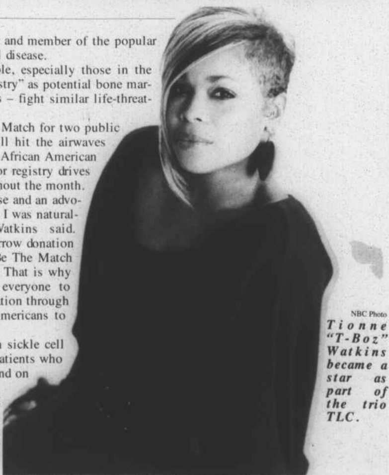
Tionne "T-Boz" Watkins became a star as part of the trio TLC.