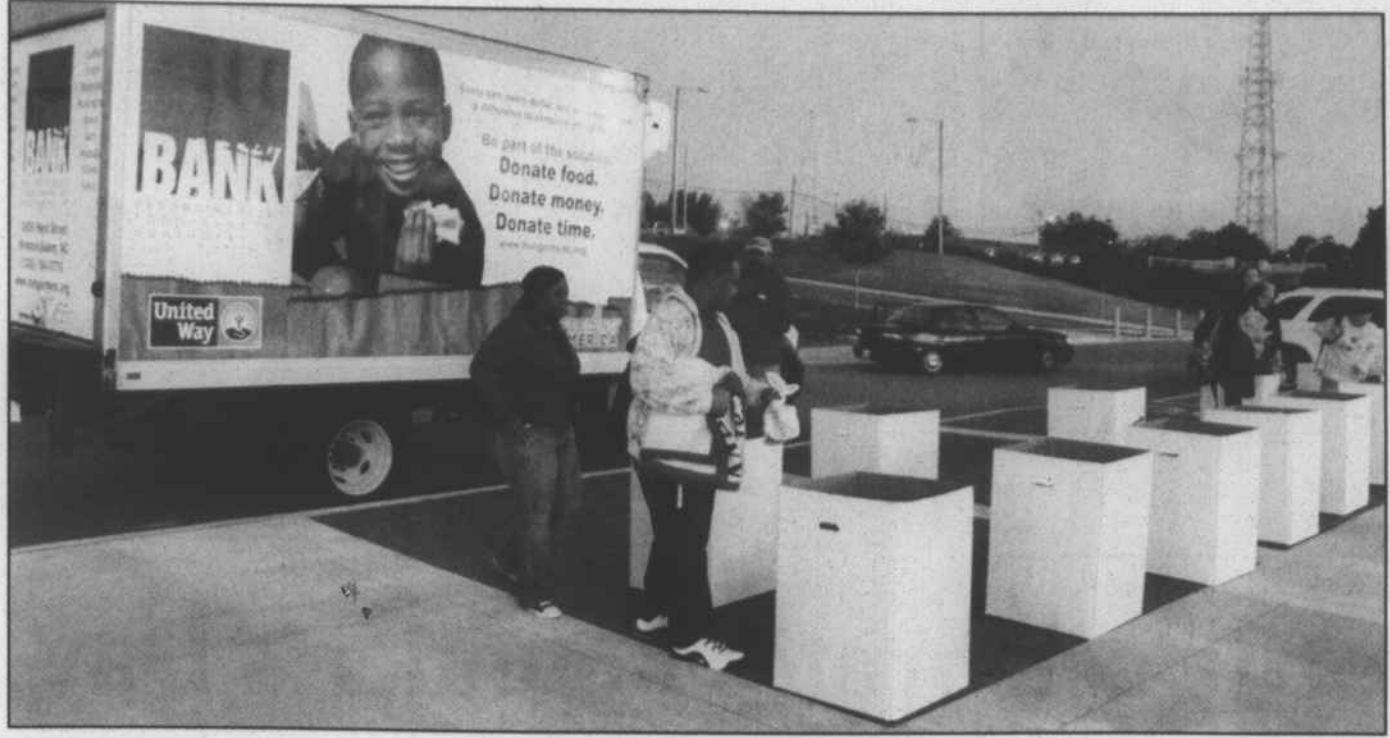
A Second Harvest truck stands-by as attendees make donations.