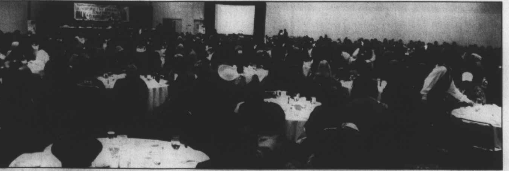
A crowd attend Monday's MLK Prayer Breakfast, an annual event hosted by The Chronicle.