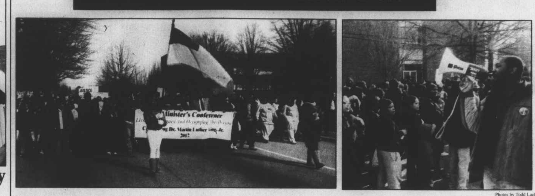
Hundreds march from Mt. Zion Baptist Church to the Anderson Center at Winston-Salem State University to take part in a series of empowerment workshops organized by the Ministers Conference of Winston-Salem and Vicinity.

The Forsyth County Aging Services Committee will meet on Friday, Jan. 20 at 9 a.m. at Senior Services