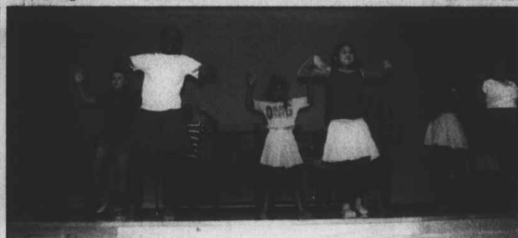
Fifth graders perform a Zumba demonstration set to Shakira's "Waka Waka"