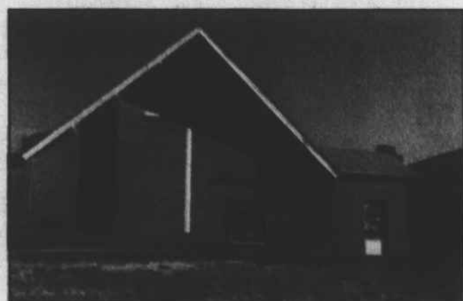
Emmanuel Baptist Church