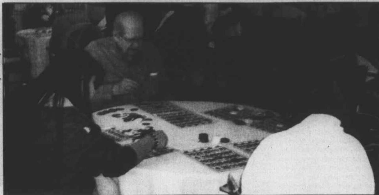
Members of E-Girls play bingo with residents of the Oaks Nursing & Rehabilitation Center.