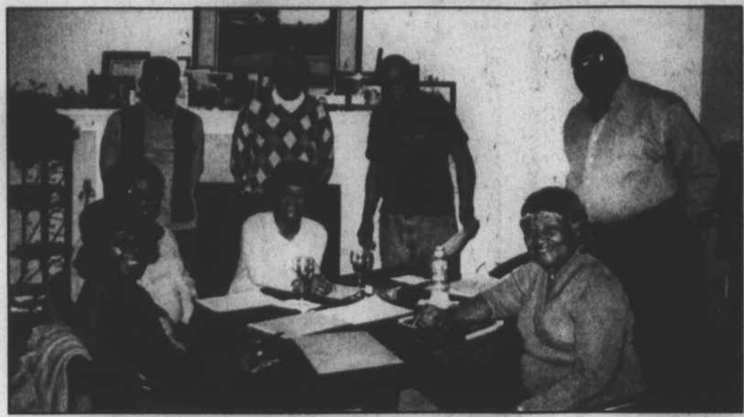
Members of the Atkins High School Reunion Planning Committee.