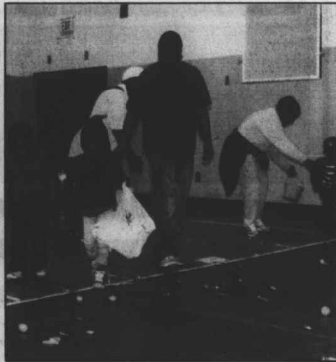
Adults help the the youngest kids hunt for candy in the 3-5 year-olds section.