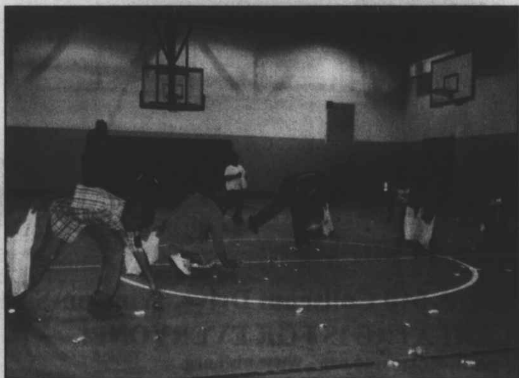
Children in the 6-8 year-olds section snatch up eggs and candy.