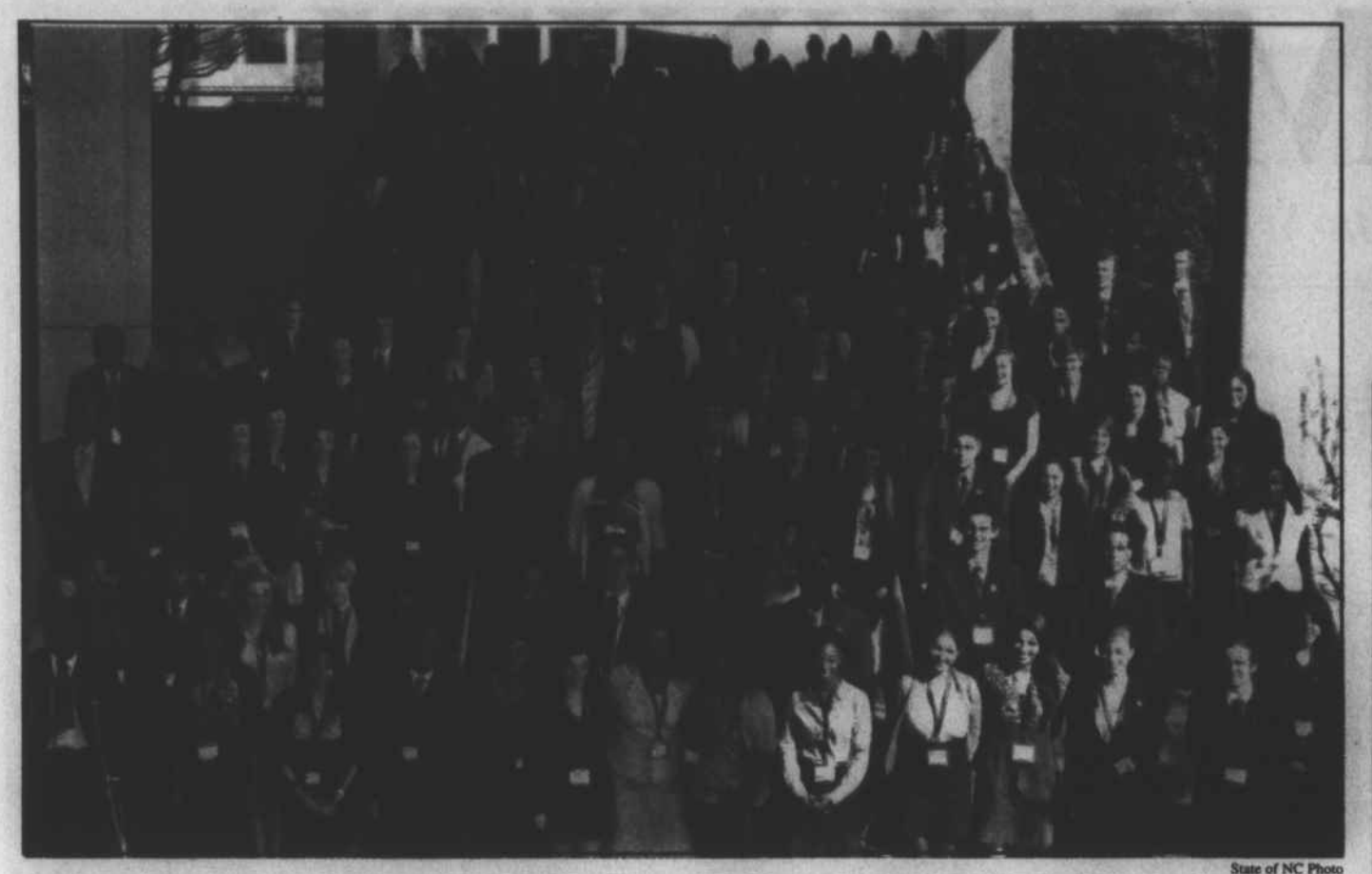
More than 200 students from across the state took part in the North Carolina Youth Legislative Assembly.