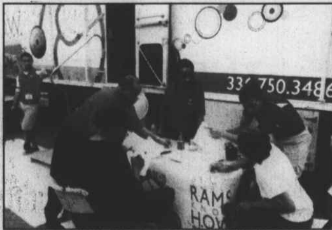
Winston-Salem State University students and faculty man the Rams Know HOW mobile unit.

A number of local health care entities will be on hand, including Winston-Salem State University's Rams Know HOW (Health on