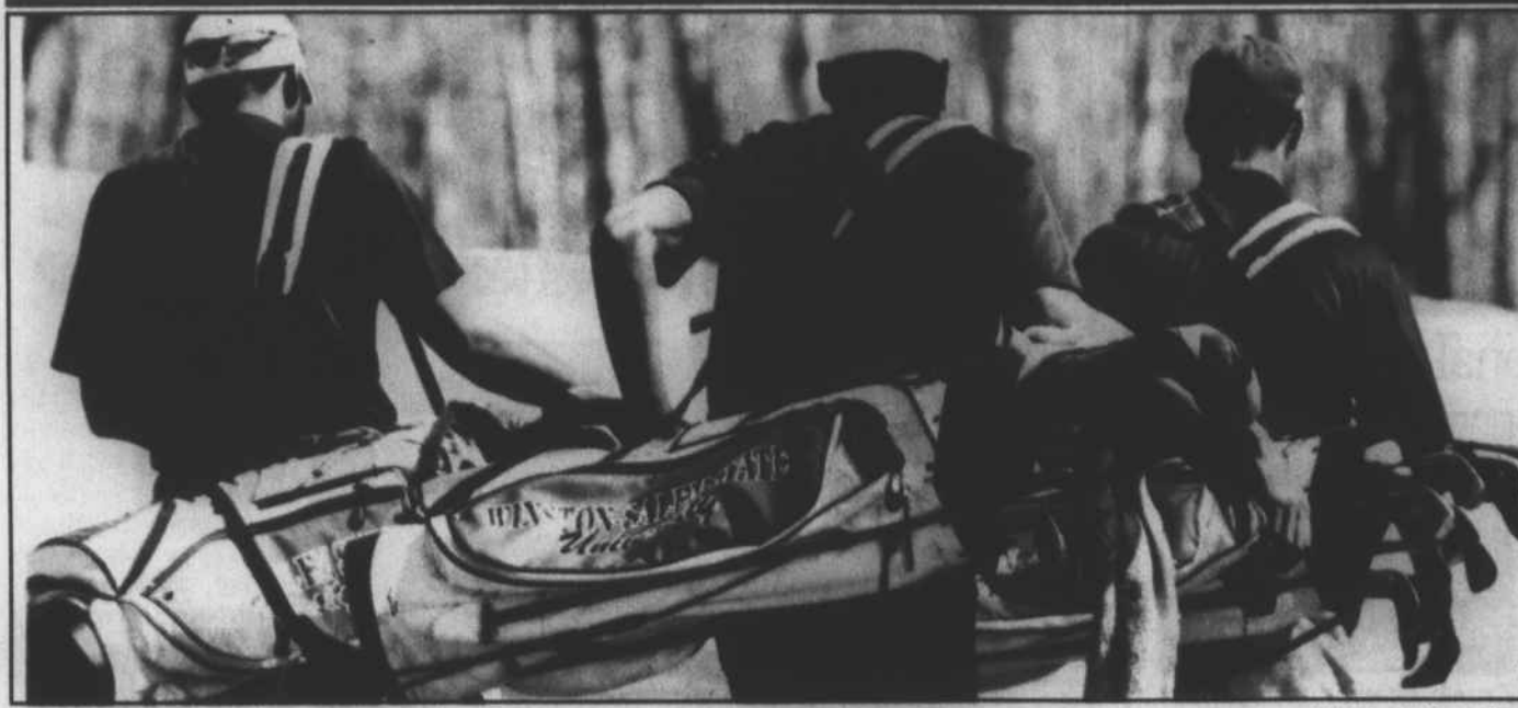
The WSSU Golf Team walked away with a victory last weekend.