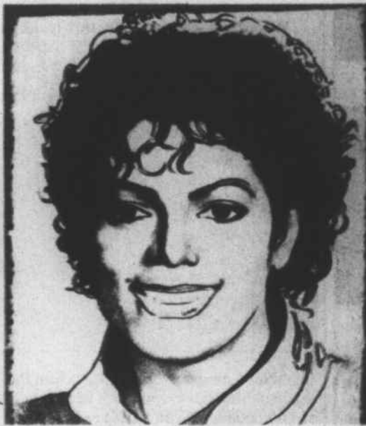
King Pop Michael Jackson