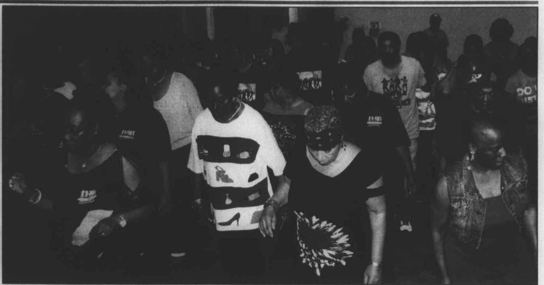
Attendees fill the dance floor at the Village Inn Conference Center in Clemmons on Saturday night.