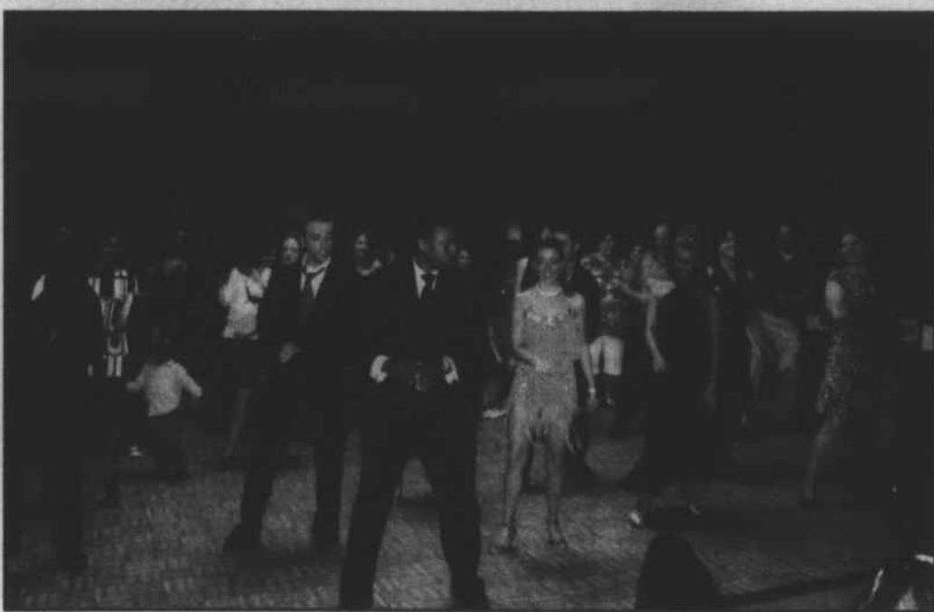
Contestants and attendees take to the dance floor at the Anderson Center last Thursday for some line dancing.