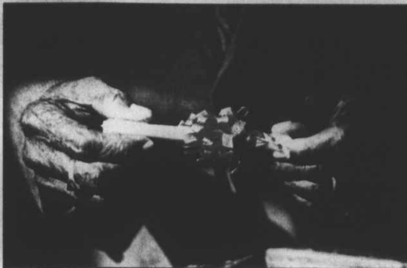
The anniversary lovefeast will include the lighting of candles.

For more information, call the Church Office at 366-722-3933 or go to www.stphilipsmoravian.org .