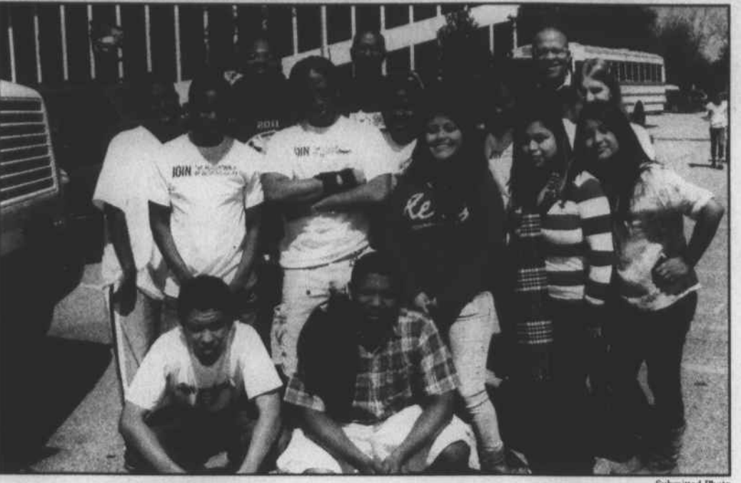
The Carver High delegation.

The students are interested in all aspects of STEM