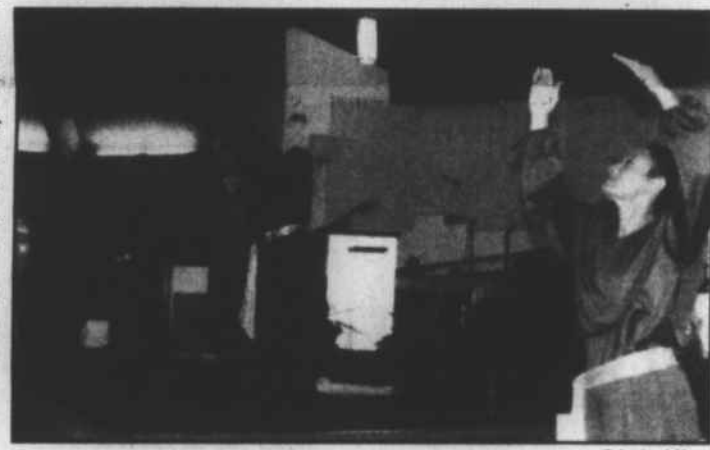
Members of the church's dance ministry perform.

Union Baptist is located at 1200 N. Trade St.