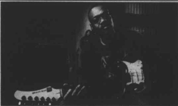
Eric Gales is considered a guitar phenom.

The Piedmont Blues Preservation Society is a non-profit organization dedicated to keeping the blues music genre alive and growing. The Society's goals are to support live performances of blues music in the Piedmont Triad, introduce