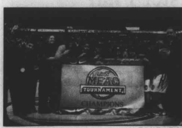
The Lady Pirates celebrate their MEAC Basketball Tourney win in March.

lected conference titles in cross country, indoor track & field, outdoor track & field