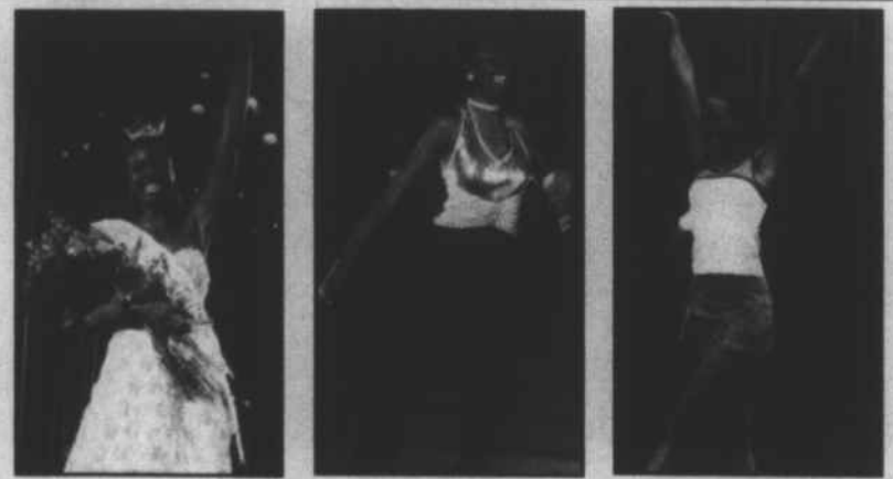
Miss North Carolina Photos