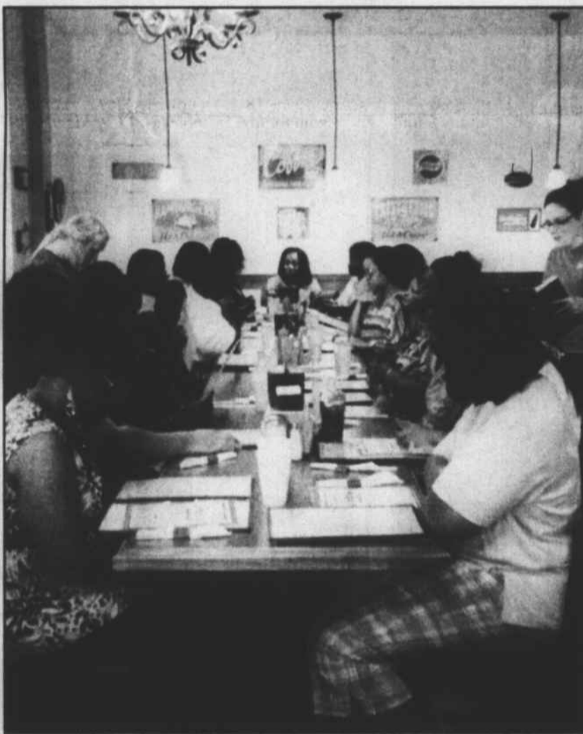
Women prepare to enjoy food and fellowship.