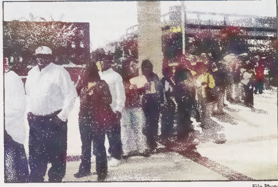
Hundreds line-up outside of the Forsyth County Board of Elections in 2008 to cast their votes early.