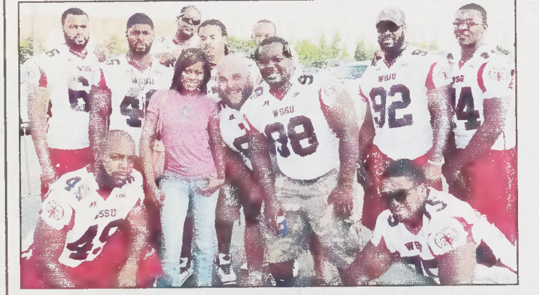
A fan poses with members of Winston-Salem State University's championship-winning football team during the school's Meet the Rams day and Booster Bash. The event was held on Saturday evening in the parking lot of Hanes Mall.