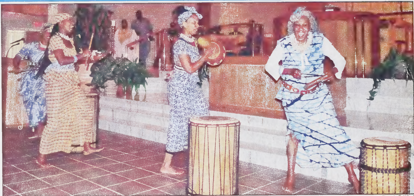
Members of the Mami Wata Cultural Arts Collective perform a dance tribute.