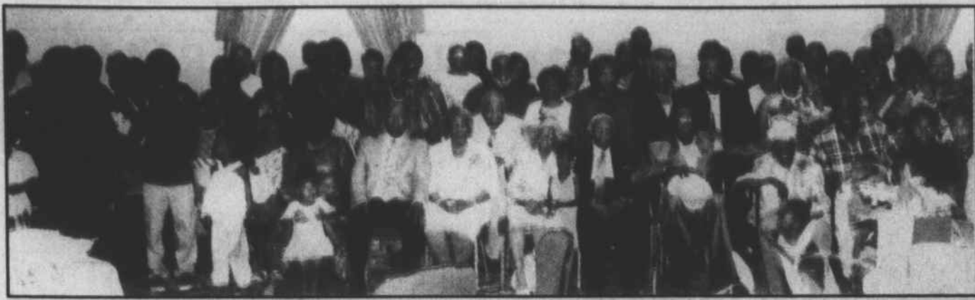
Members of the family pose for a photo.