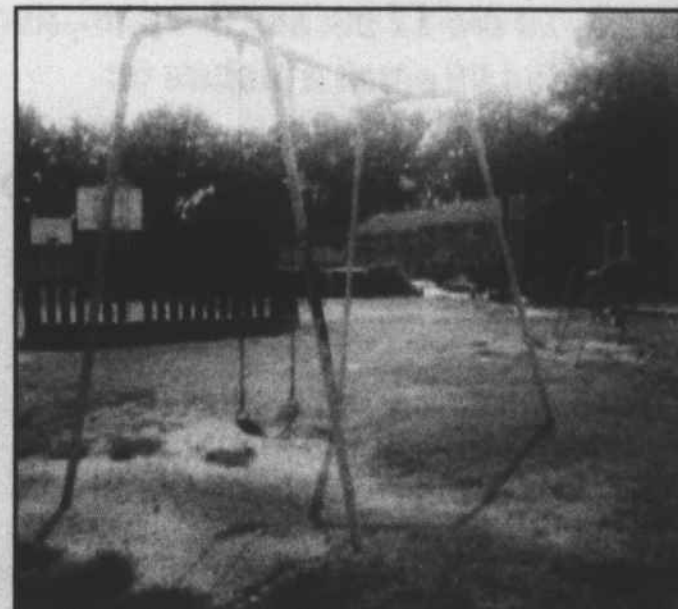
A view of the playground before the improvements.

The team of volunteers worked to improve the complex's dilapidated playground