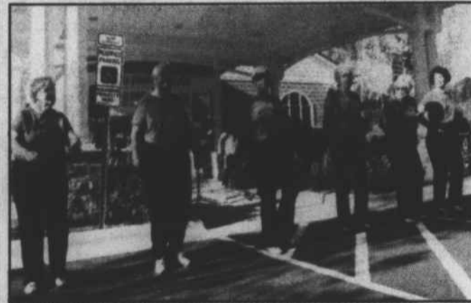
The Southfork Cloggers entertain the crowd.

members at the three schools. Many of the committee members are retired educators, so meeting the needs of students is dear to their hearts. An ongoing project of the Chapter is collecting "Box Tops for Education" from popular common products to benefit Kimberley Park Elementary School. Alpha Kappa Alpha has a long-standing history of supporting education.