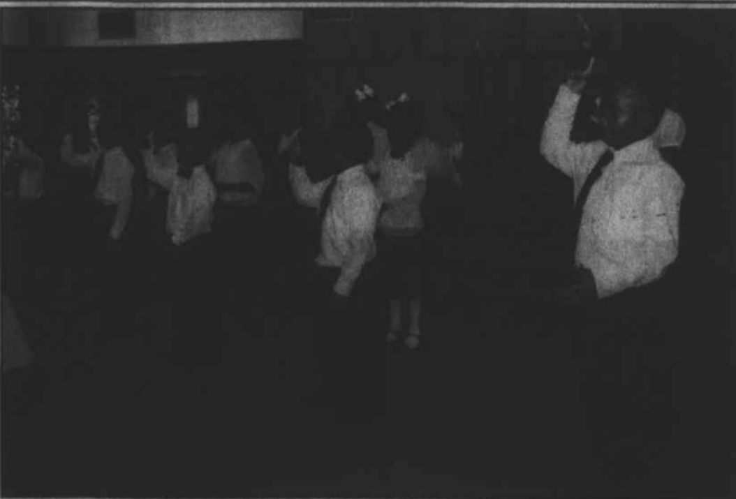
Students perform during the Oct. 27 program.