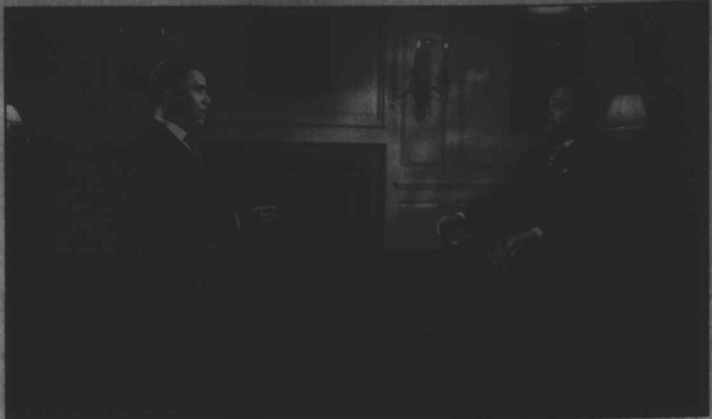
Roland Martin (right) interviews President Barack Obama on Jan. 11, 2010 in the Map Room of the White House for Martin's TV One show.