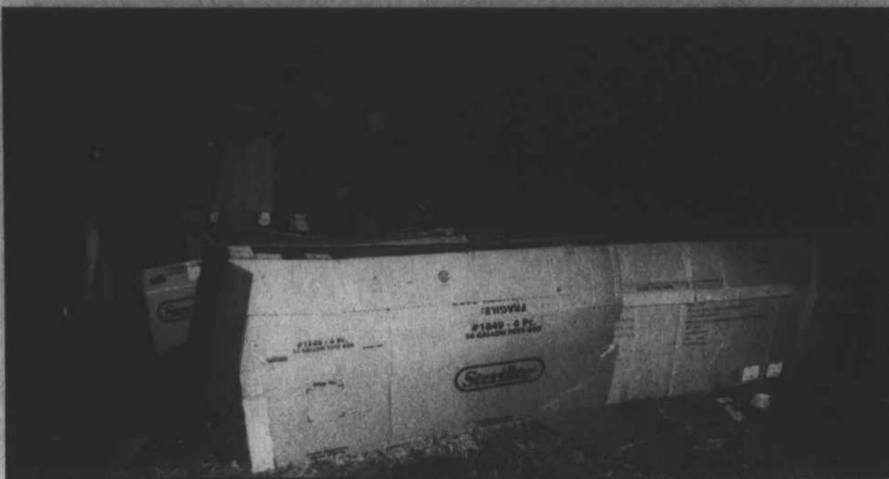
WSSU students prepare to take part in last year's sleep-out.