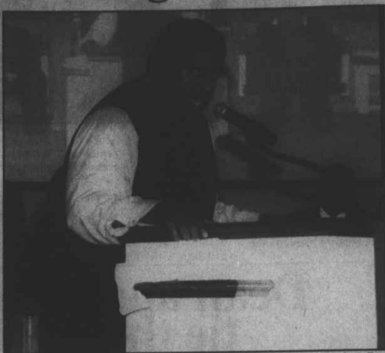
Rev. Dr. William Barber preaches at Union Baptist's Get Out & Vote Revival last month.

The revival was a non-partisan program designed to encourage individuals to exercise their right to vote and to provide information to help voters make knowledgeable decisions. Voter registration and polling information and an opportunity to meet the candidates were also included in the programming.