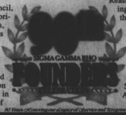
All items of clothing are property of Sigma Gamma Rho Sorority, Inc. A Legacy of Sisterhood, Leadership and Service.

Sigma Gamma Rho was organized in 1922 by seven school teachers on the campus of Butler University in Indianapolis, Ind. It is the only one of the four historically African-American sororities in the National Pan-Hellenic Council that was established on a predominantly white campus. Today, Sigma Gamma Rho impacts communities