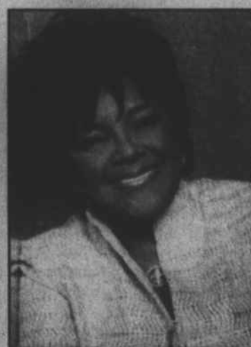
Dr. Shirley Caesar

Caesar, a native of Durham, has released more than 30 solo gospel albums and has received numerous recognitions during her career, including 11 Grammy Awards, 13 Stellar Awards, an NAACP Achievement Award and induction into the Gospel Music Hall of Fame.