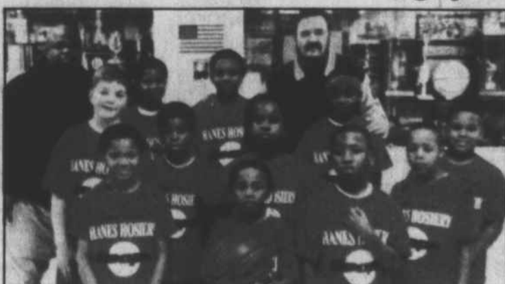
The Wolfpack (left) and Celtics pose with their coaches.