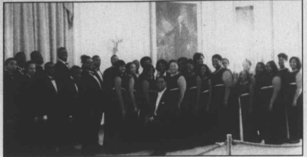
Members of the N.C. A&T State University Choir.