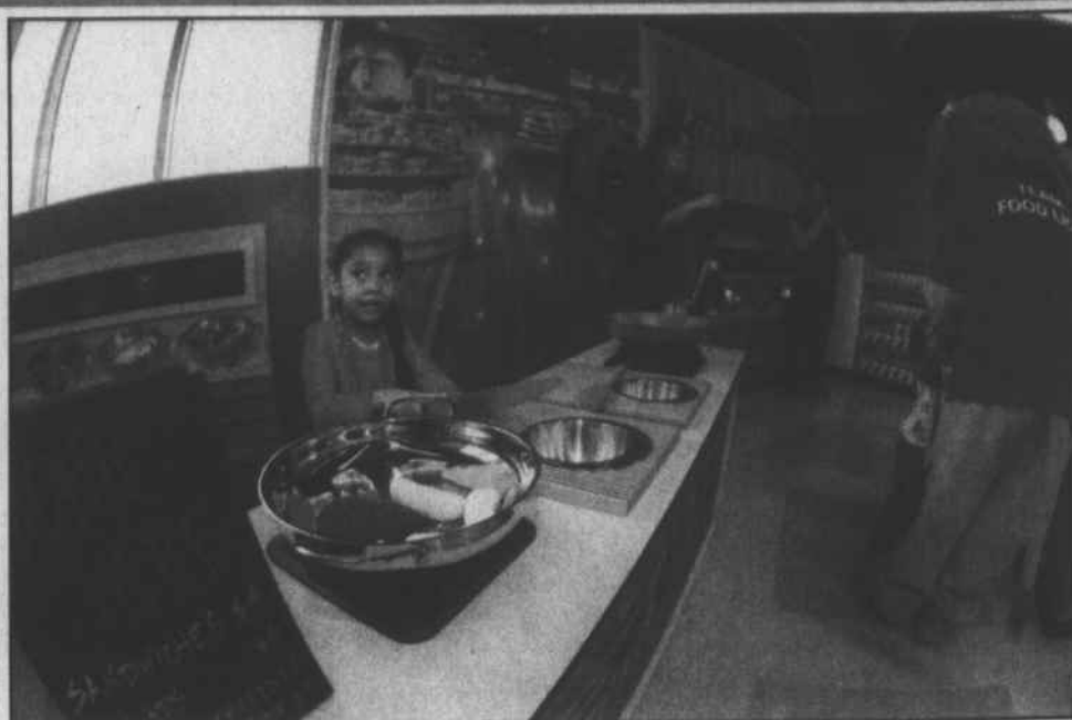
Kids explore the new exhibit.