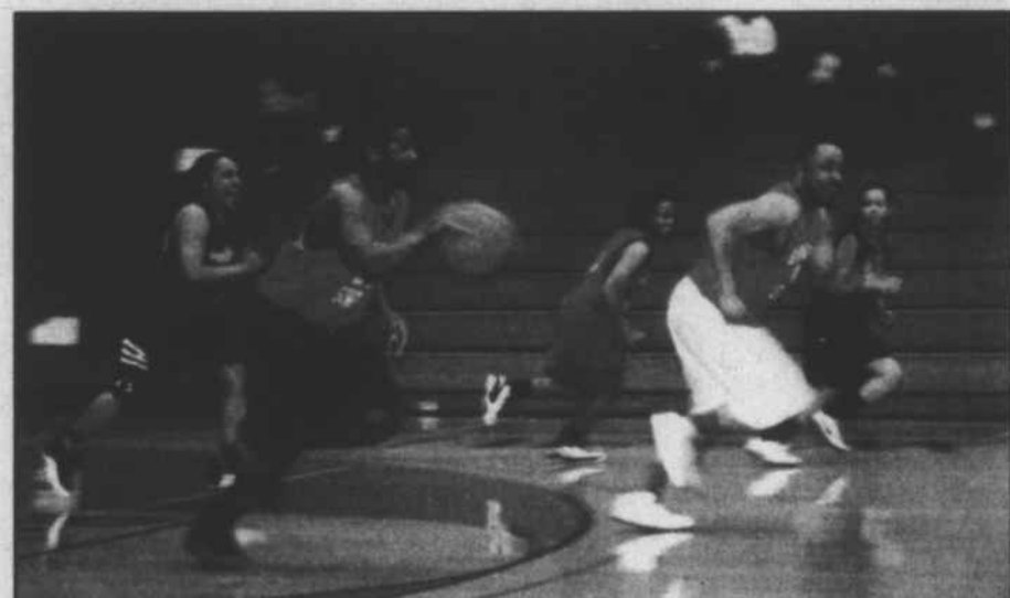
Former ballers enjoy their time back on the court.