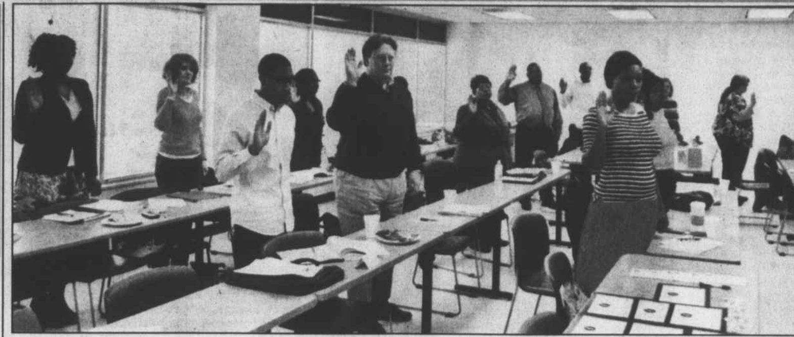
A class of new Guardians ad Litem volunteers is sworn in on Saturday.